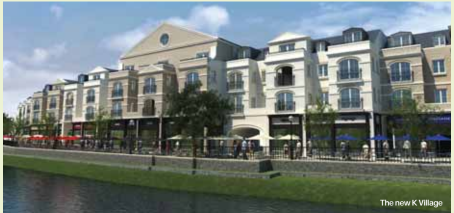
The new K Village