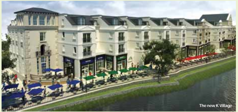
The new K Village

As Cumbria's tourism industry prepares for the coming season, it does so with a severe winter well behind it. Snow and floods have all made their mark on the news but beyond the headlines, the Lake District and Cumbria are back to normal and doing what it does best - making visitors happy.